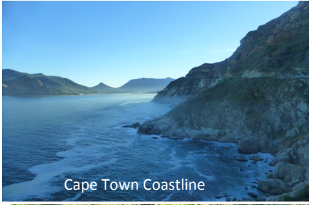
Cape Town Coastline